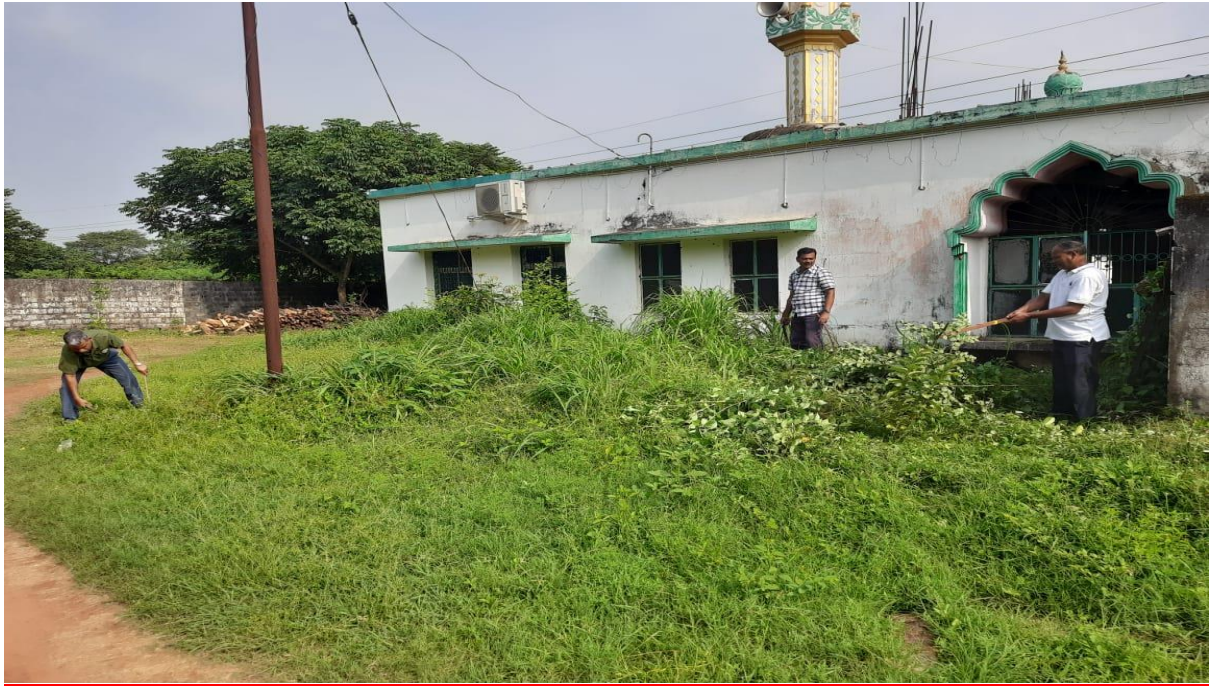
(IOP members cutting weed at masjid)