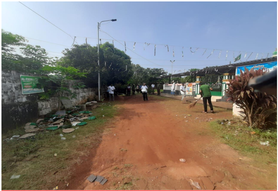
(IOP members cleaning at masjid)