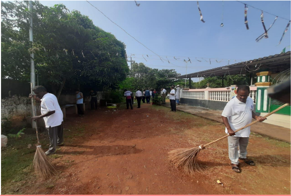
(IOP members cleaning at masjid)