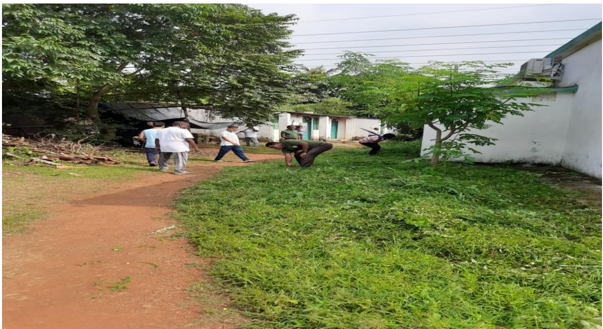
(IOP members cutting weed at masjid)